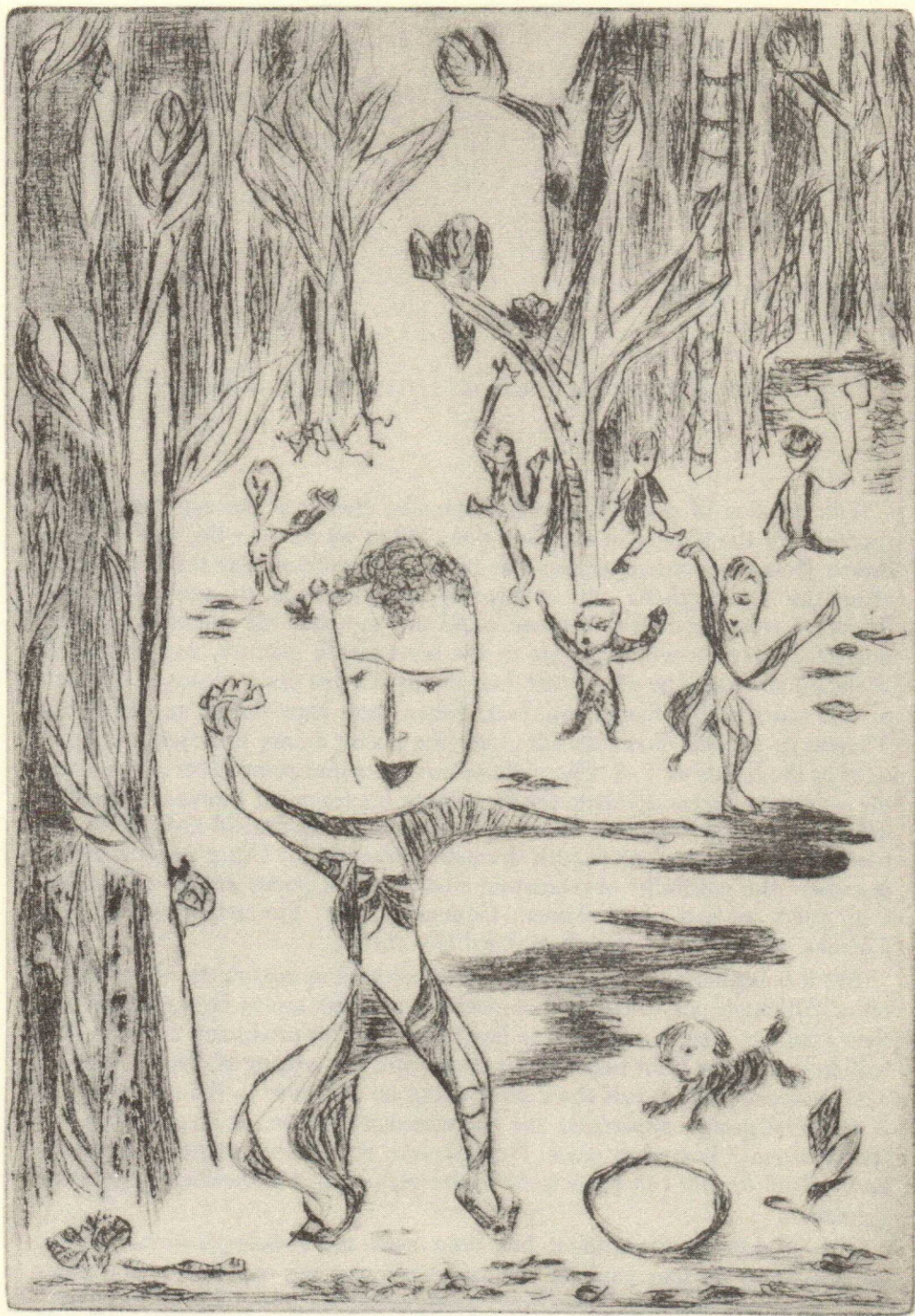
Etching, Dream Children , Nedra Peterson