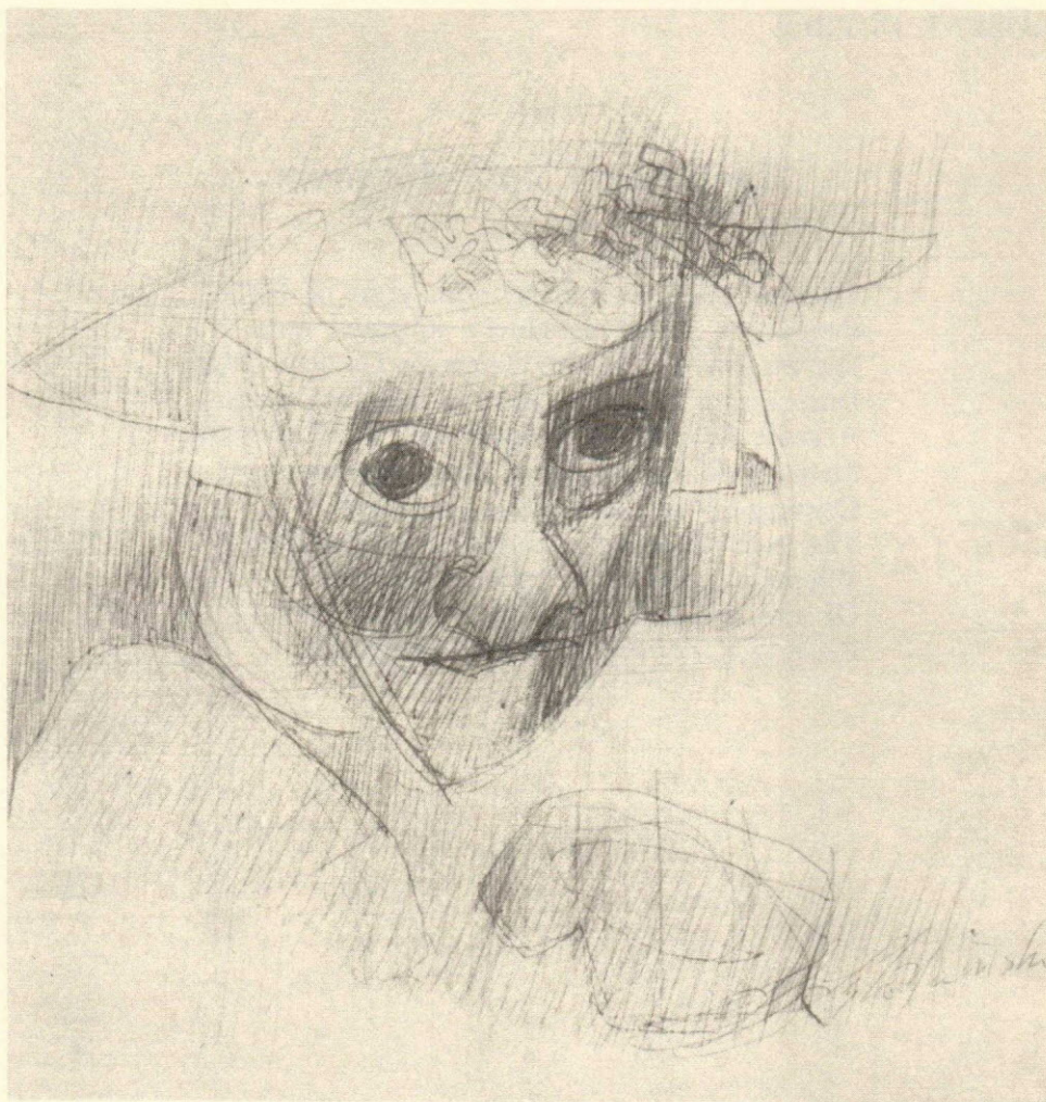
Drawing, Old Lady , Lyle Novinski