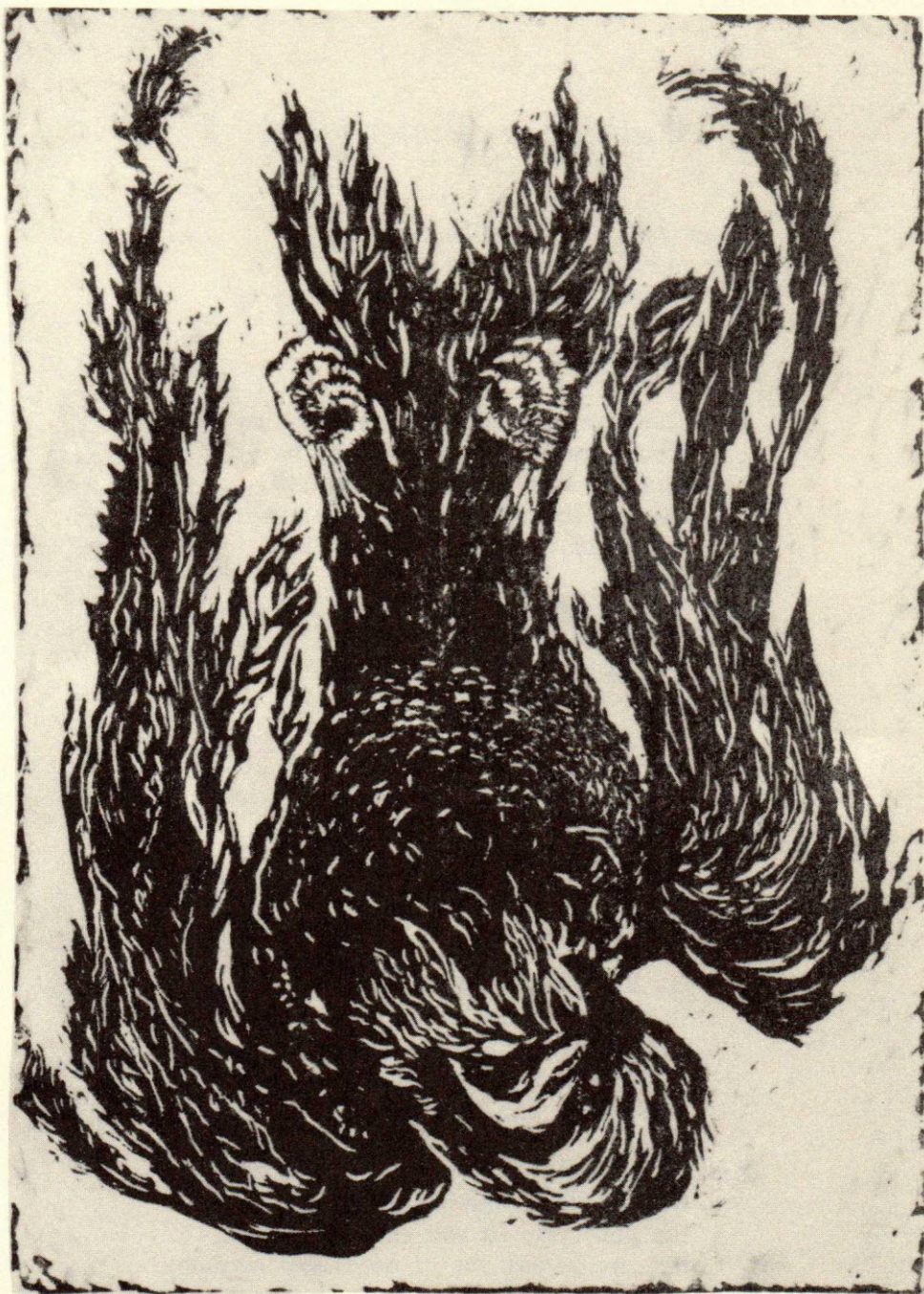
Block print, Falling Bird , Nedra Peterson